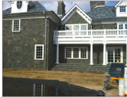
Thinstones give that classic look